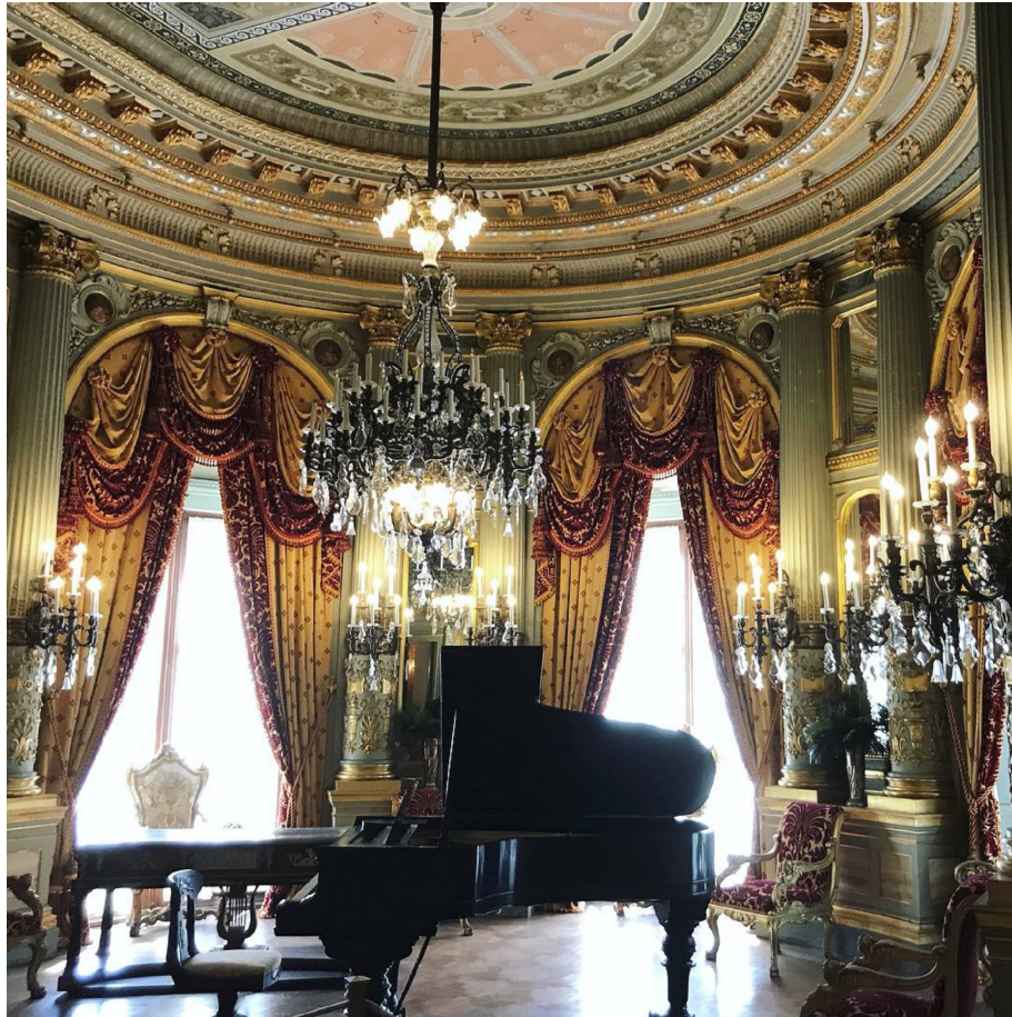
The Breakers Music Room

Get a taste of what it was like to live like the Russells and the Van Rhijns in HBO's new hit, and stay tuned for more glimpses of the famed Newport mansions as the season continues. And go behind the scenes of The Gilded Age in the fun featurette, below.