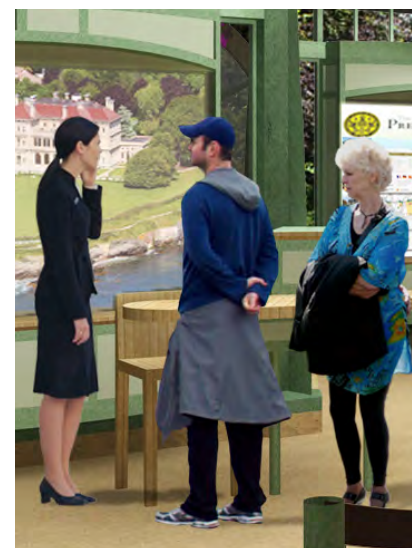
Ticketing pavilion at the Welcome Center