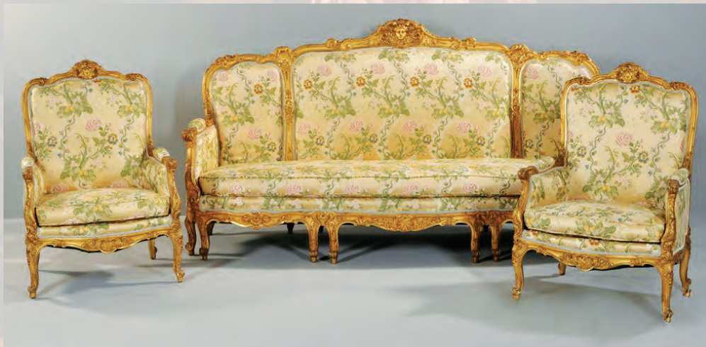
Suite of furniture custom-designed for The Elms, reacquired with The Collections Fund

Finally, the Collections Fund supported efforts to digitize our museum and archive collections, making them available online via a collaborative website for the display of Newport-related collections, Newportal ( newportal.org ).