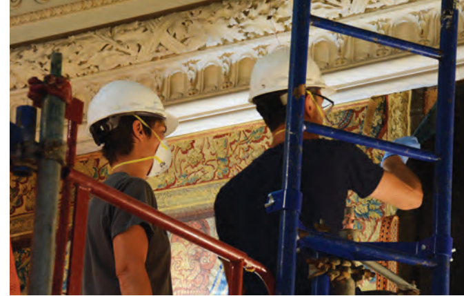
Conservators study the van Mander tapestry at The Breakers

GENERAL HOUSE This house was one of the earliest National Historic Landmarks and was preserved by the National Trust for Historic Preservation. It is now open to the public as a National Historic Site. 1945