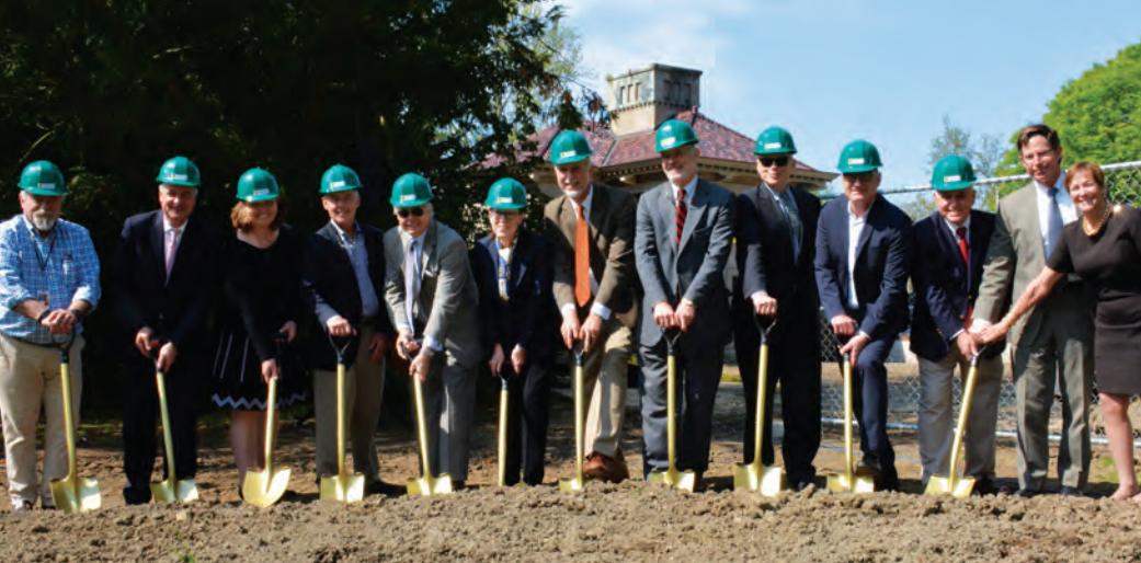
Groundbreaking for the Welcome Center at The Breakers, May 2017