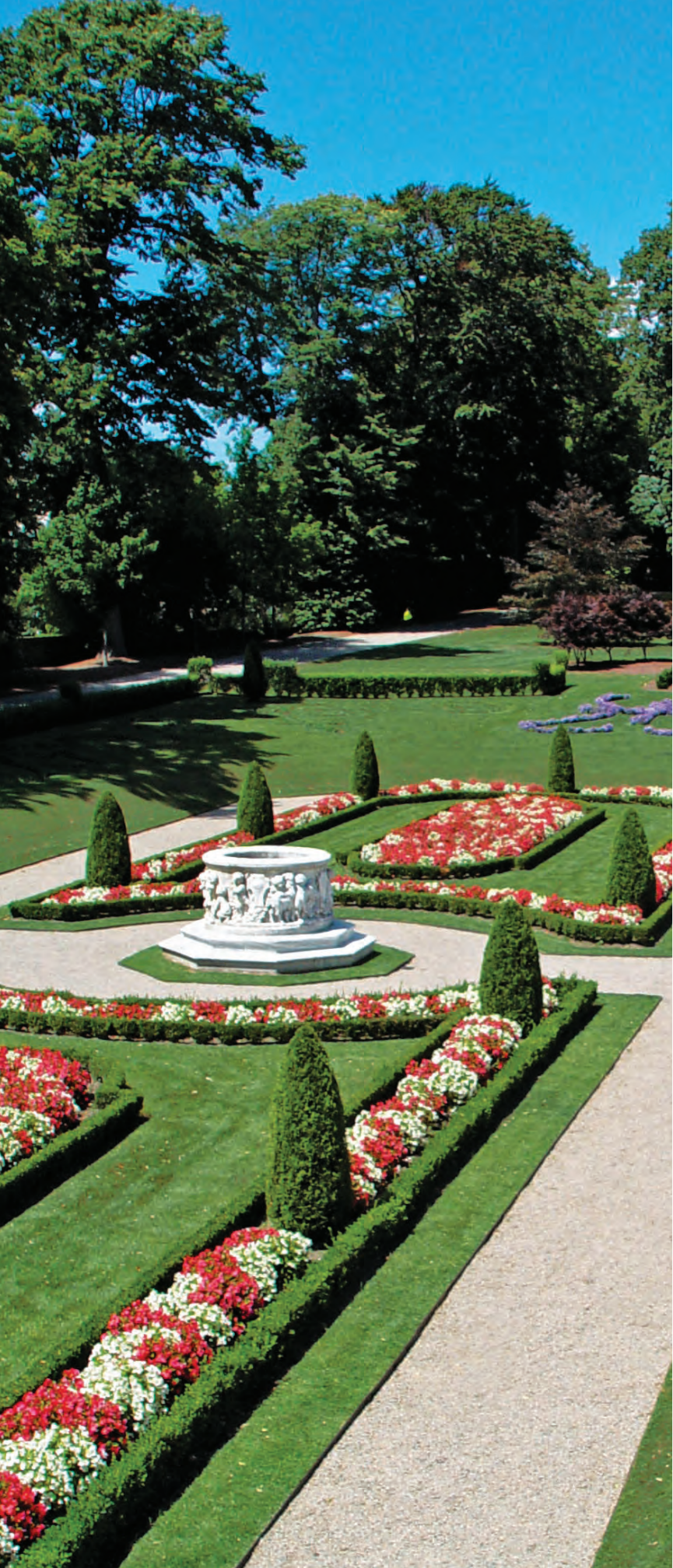
Sunken Garden at The Elms