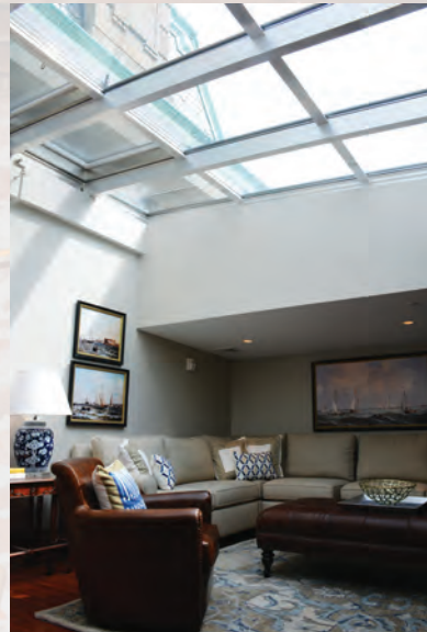
The Berwind-Stautberg Center gathering room