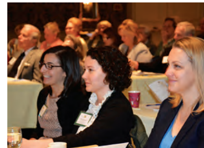
Fellows attending The Newport Symposium