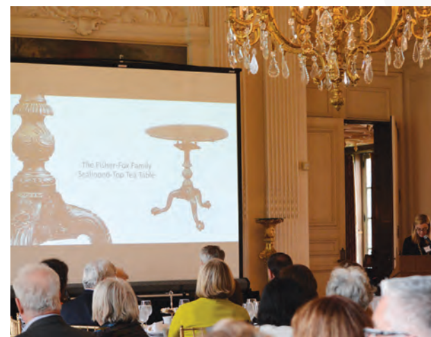
The Newport Symposium