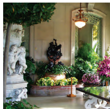
The Elms Conservatory

A robust permanent endowment enhances organizational stability, credibility, and prestige by sending a message of planned long-term stability, fiscal responsibility and financial viability. For donors, an endowment gift perpetuates their values and priorities in the wake of change by providing assurance that programs that are important to them will survive and serve as a permanent tribute to their support. In addition to contributions to the operating endowment, we received support to enhance specific endowment funds for Hunter House and The Elms.