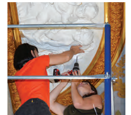
Gold Room ceiling restoration at Marble House

COVER Detail of the Gold Room ceiling at Marble House