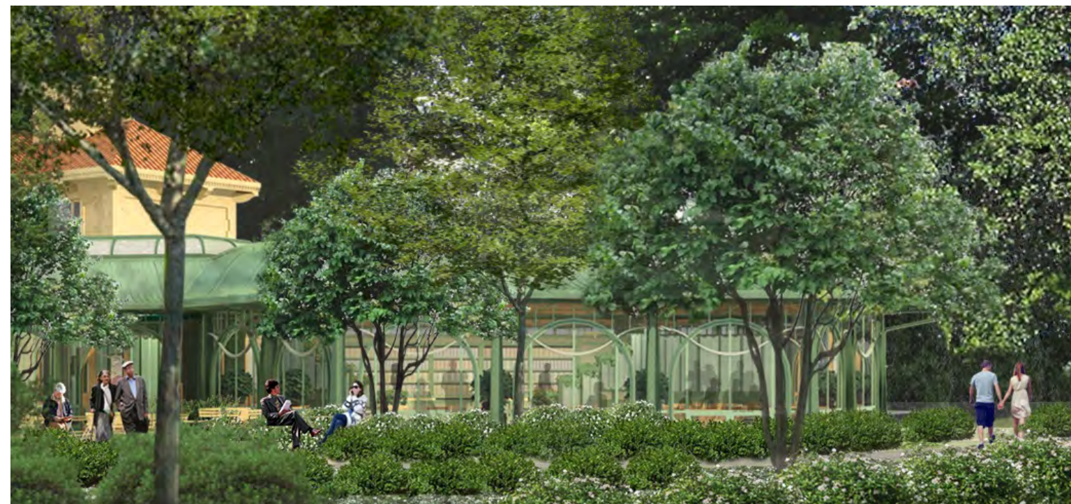
Conservatories from the Gilded Age inspired the glass walls and pre-patinated copper roof

Inspired by park pavilions and conservatories from the Gilded Age, the one-story, 3,650-square-foot pavilion respects the historic integrity of the site. The building is sited in an existing grove where its low profile and pre-patinated copper roof will ensure that it does not visually intrude on significant sight lines. Inside, visitors can gather with family and friends; purchase tickets and memberships; explore the history of Newport and our properties; relax with light refreshments and access ADA-compliant restrooms. The Breakers Welcome Center is under construction and expected to open in summer 2018.